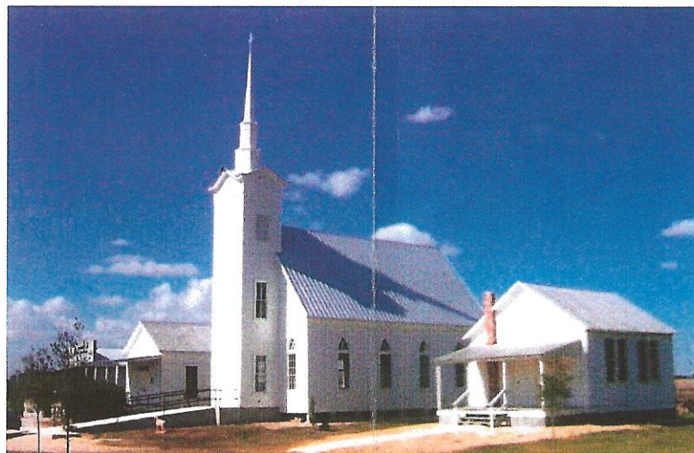
Zion Church – Services in German